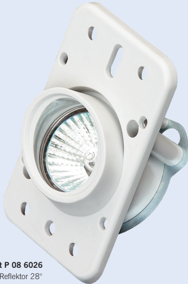
Image.: Reading light P 08 6026 with cold light mirror Reflektor 28°