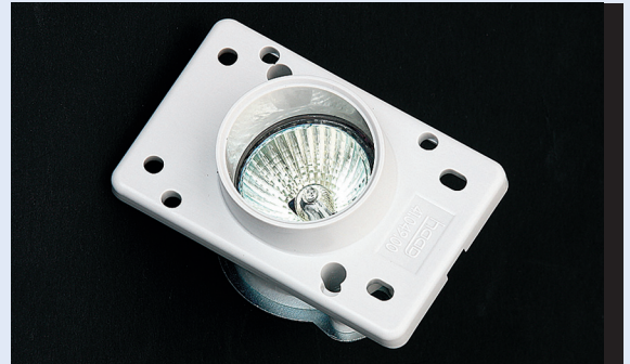
Image.: Reading light P 08 6029 with cold light mirror Reflektor 20°