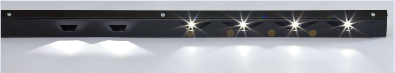
Image: Drivers desk-LED lamp 143 565_050 front view