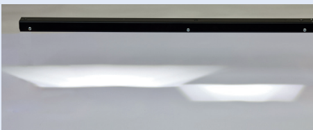
Image: Drivers desk-LED lamp 143 565_050 side view

The light is intended to be built under a desk cover, or assembled in a casing. Its low height facilitates the covered installation. The housing is sealed, but the cover only screwed. A higher IP-safety class can be offered.