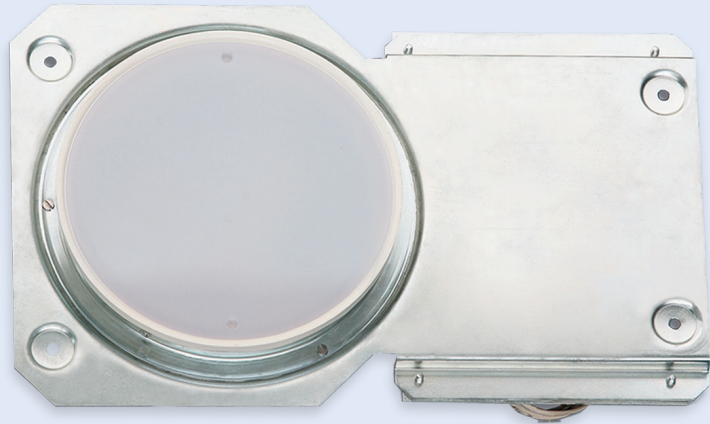
Image: Ceiling fitting light, round shaped 00 92 50 back view