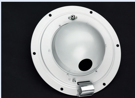
Image: Tail light (red) 142 404 00 back view