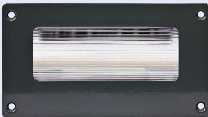
Image: LED tread light 143 567_96 front view