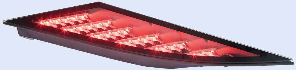
Image: LED head light white/red 143 577_02 / _03