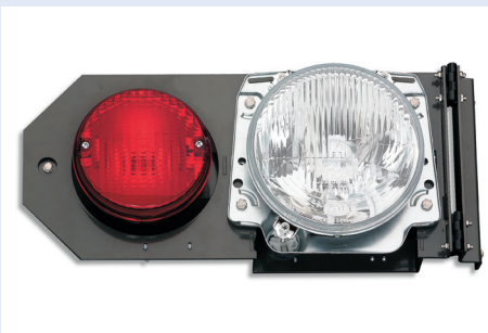
Image: Combination headlight/rear light (right) 142 958 10 front view

This combination will be assembled behind the front, and has to be folded out through hinges for maintenance purposes. It consists of a P43T – headlight and a rear light which is mounted on a carrier.